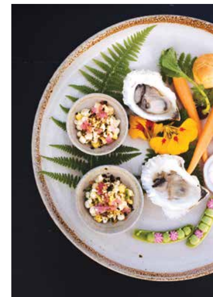
The view at Aragosta is as heavenly as the menu, which spotlights local seafood.

the river make for a million-dollar experience. It's also tough to argue with Chebeague Island Inn 's dining room, hovering over sparkling Casco Bay, or with the extraordinary experience of sitting at Ocean while taking in the surging waves of the Atlantic.