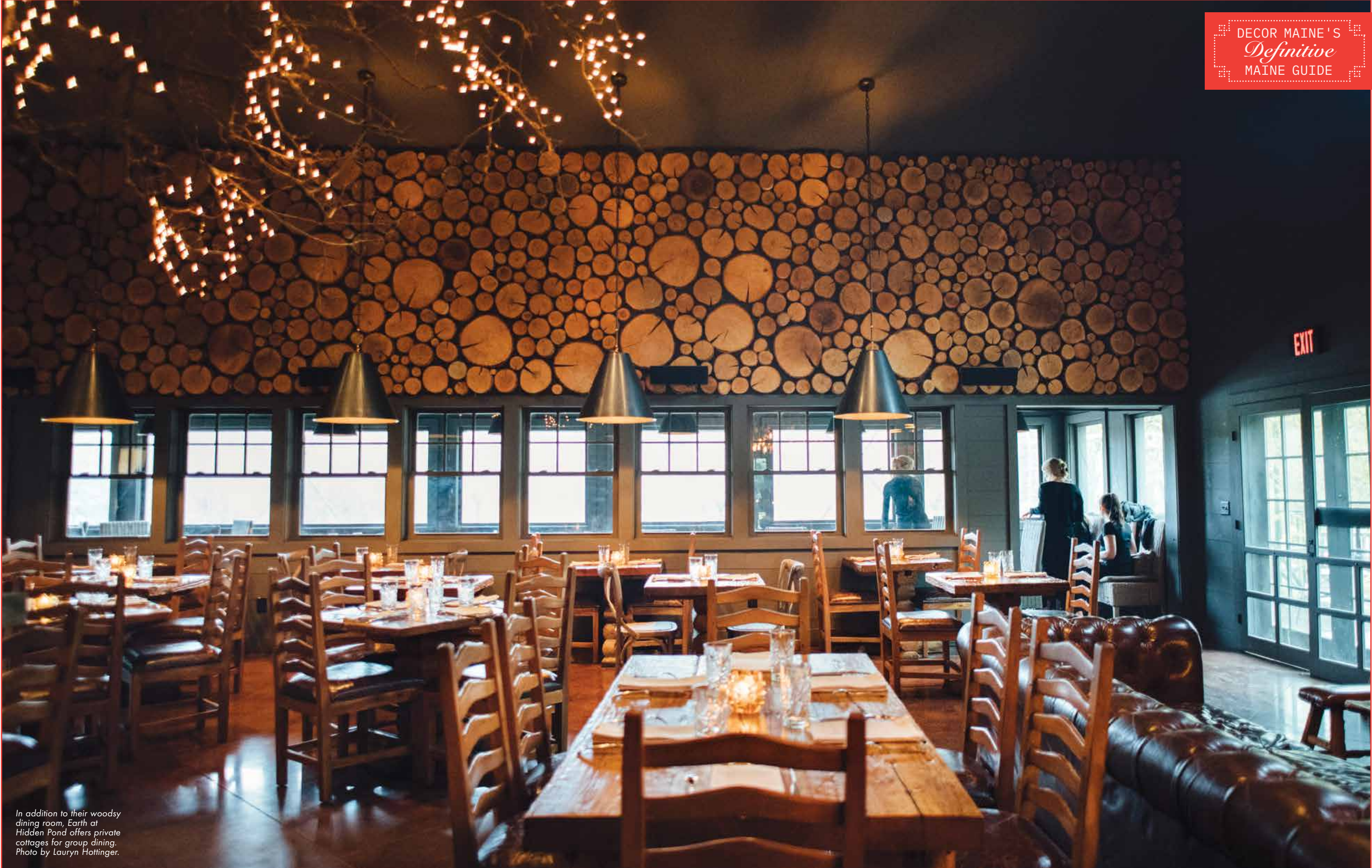
In addition to their woodsy dining room, Earth at Hidden Pond offers private cottages for group dining.