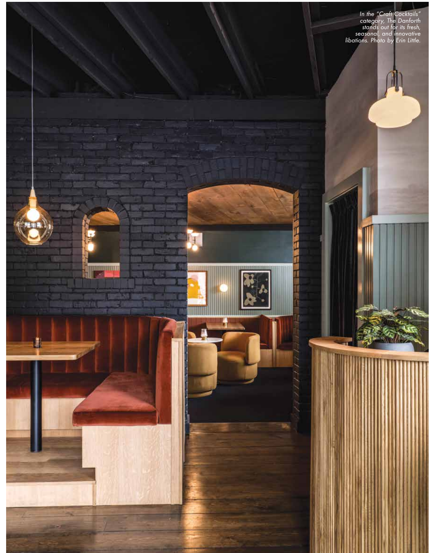
In the "Craft Cocktails" category, The Danforth stands out for its fresh, seasonal, and innovative libations.