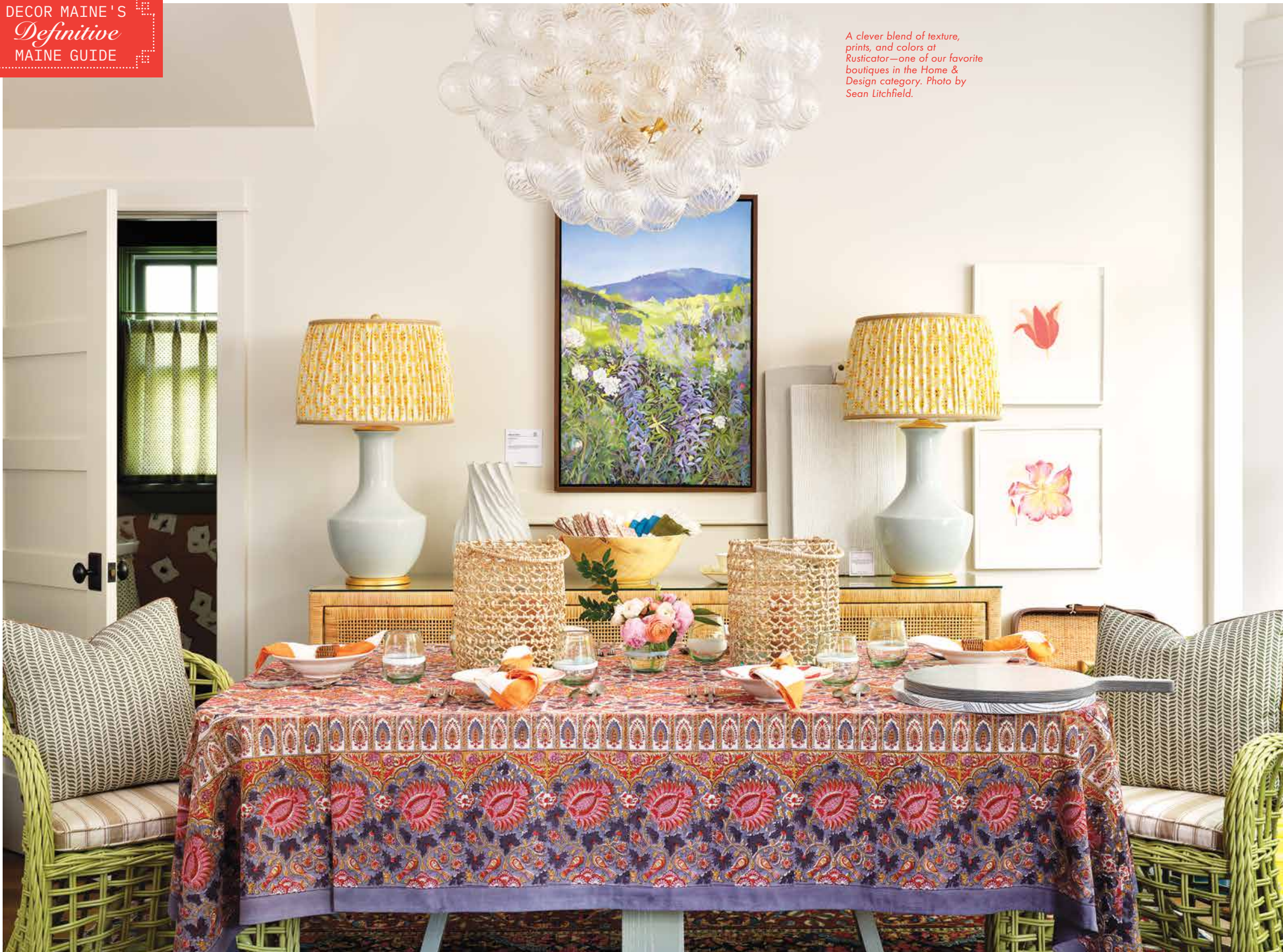
A clever blend of texture, prints, and colors at Rusticator—one of our favorite boutiques in the Home & Design category.