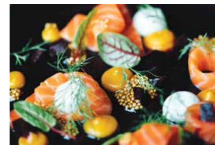
A mosaic of raw salmon, organic seeds, and herbs at Earth at Hidden Pond restaurant.

A successful group dining experience relies on a few key things: A staff's ability to deftly juggle and synchronize lots of requests—as we've witnessed repeatedly at Scales and Solo Italiano —and table settings that let guests comfortably eat and talk together. For the latter, we love the extra-long table at Gather . And access to a beautiful private room is always a